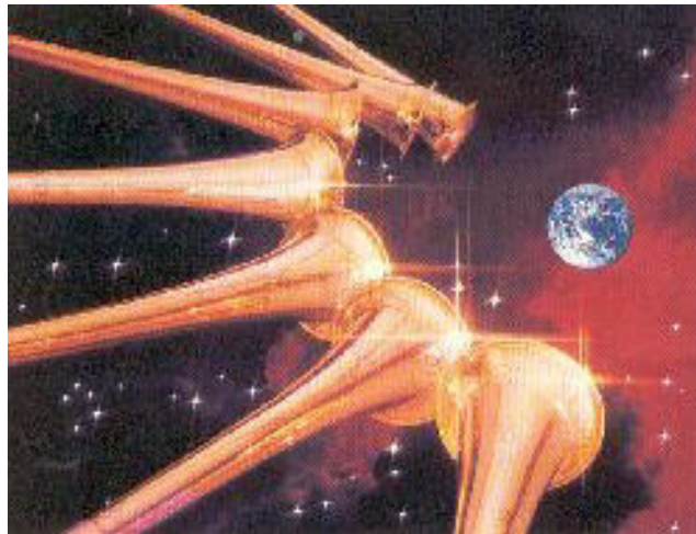
The Seventh Trumpet Blast

COMMENT: The seas will be gravely affected by this plague. One third of the seas will turn to blood, one third of life in the seas will be